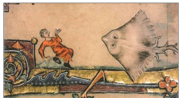
Detail from an illuminated manuscript ('The Macclesfield Psalter') produced ~AD 1330 in eastern England, showing a large Common Skate Dipturus batis (Fitzwilliam Museum, Cambridge) – a species then common, but now considered locally extinct.

Related publications: Sguotti C, Lynam CP, García-Carreras B, Ellis JR, Engelhard GH (2016) Distribution of skates and sharks in the North Sea: 112 years of change. Global Change Biology 22: 2729-2743 (doi:10.1111/gcb.13316), and Sguotti C (2014) From 1902 to 2013: one hundred and twelve years changes in the abundance and distribution of 8 species of elasmobranchs in the southern North Sea. MSc Thesis, Univ. Padua, Italy, 105 pp.